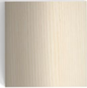
Wood 1 9001