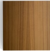
Wood 2 9002