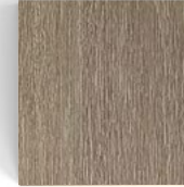
Weathered Teak 9004