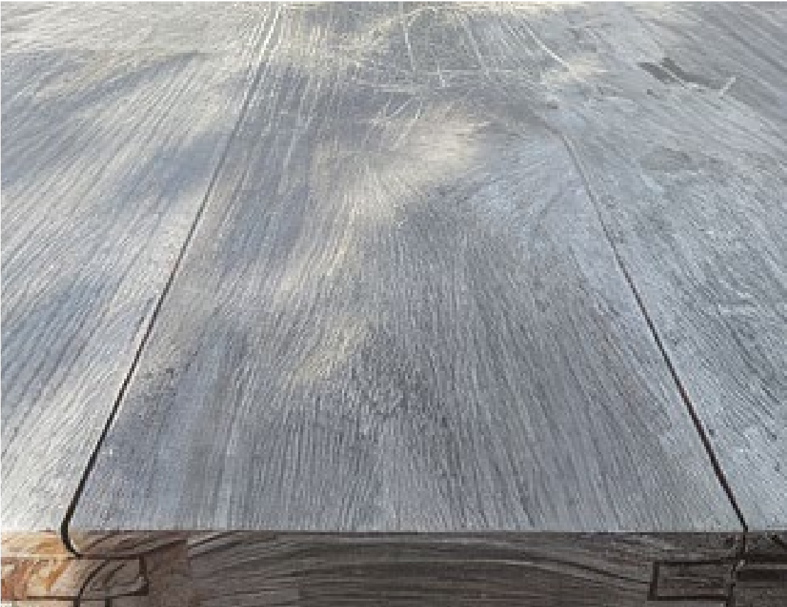
Example of sun-degraded wood.

Teak can sweat out its internal oil. This will always happen due to a sudden absorption of a sudden absorption of a large amount of water (heavy rain).